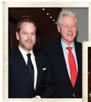
Kiefer Sutherland and President Bill Clinton

With over 13,000 diplomats and international experts on hundreds of subjects working at UN Headquarters in New York and in at least a dozen other cities around the world, the United Nations is a huge international institution. It has 193 members and over 20 specialized agencies like WHO and UNICEF. It spends over $4 billion dollars annually on goods and services. It implements critical development projects all over the globe. And it has over 125,000 UN peacekeepers working in 15 different operations around the world.