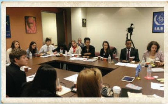
Boot Camp participants being briefed at UN Headquarters

The UN Boot Camp is a week-long immersion study program that gives students the opportunity to explore, examine and experience the inner workings of the world's premier global governance body. By the end of the Boot Camp, students have gained first-hand knowledge of how multilateral Diplomacy is crafted and implemented, not from their textbooks, but by the practitioners themselves senior UN officials, Ambassadors, members of the UN Diplomatic Corps, UN agencies and NGO staff, American legislators