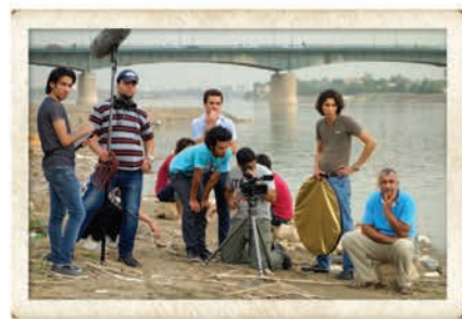
Young Iraqi filmmakers shooting their short films

At the Humpty Dumpty Institute, we care a lot about Public Diplomacy and how NGOs can play a productive role in creating new closer ties between the United States and countries around the world. Over the years, we have launched many public diplomacy initiatives, cultural programs, music and art exchanges, sports programs. One of our best programs – The International Film Exchange brings young filmmakers from around the world to Hollywood and assists them in developing the technical and creative tools needed to document important social issues in their countries of origin. The International Film Exchange provides training to young filmmakers and organizes outlets for their films; it also raises awareness in the U.S. film industry about important international social issues. Participants include producers, directors, writers, cinematographers and actors. In partnership with the UCLA School of Theatre, Film and Television (TFT), this program allows international filmmakers to travel to the United States, learn about filmmaking from top American artists and receive hands on mentoring and support. At the end of this program, participating filmmakers are provided small grants to produce short films.