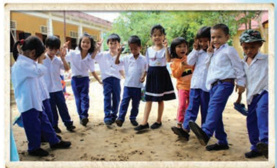
Vietnamese children dancing

The Humpty Dumpty Institute implements medical and public health programs that improve pre- and post-natal care, provide immunizations, support mental health, and deliver medical supplies. The Humpty Dumpty Institute recently completed projects in Myanmar to improve emergency medical services for victims of landmine accidents and in Sri Lanka to provide post-tsunami health care assistance to 10,000 children and mothers in 19 villages. Today, HDI carries on its work in the health arena by shipping critical medicines to vulnerable populations around the world who are suffering from the effects of natural disaster or are experiencing a shortage of life-saving medicines due to conflict. In recent years, we have sent millions of dollars of medicine to Somalia, Nepal, and Mozambique. For detailed descriptions of these projects, visit our website at www.thehdi.org .