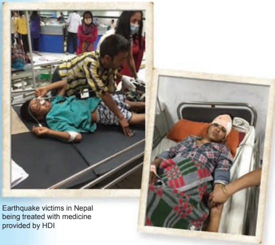
Earthquake victims in Nepal being treated with medicine provided by HDI