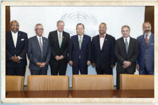
US Congressional Delegation Meets with UN Secretary General Ban Ki-Moon

Secretary-General Ban Ki Moon has described HDI as an indispensable organization. Since its founding in 1998 the Humpty Dumpty Institute has worked to foster an ongoing dialogue between the U.S. Congress and the United Nations by arranging for Members of Congress and Congressional Staff to travel to New York City to discuss significant and timely issues with U.N. Officials. The Humpty Dumpty Institute is the only NGO that consistently brings together leading members of Congress and the leadership of the United Nations. Since 1998, HDI has convened 50 delegations hosting roughly 600 Members of Congress and staff at the United Nations where they have met with the U.N. Secretary General, his senior deputies, and dozens of foreign diplomats accredited to the United Nations. These programs allow elected U.S. leaders and their staff to better understand how the United Nations can complement U.S. foreign policy objectives as well as allow them to present ideas, concerns, and proposals directly to the United Nations.