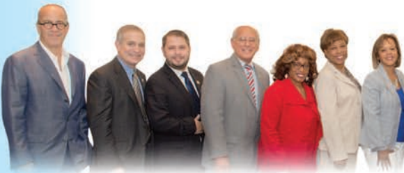
48th Congressional Delegation to United Nations Headquarters