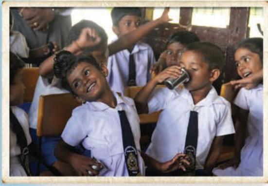
Sri Lankan kids enjoy a cup of warm milk and cookies

When it comes to life-saving humanitarian work around the world, the Humpty Dumpty Institute is among the nation's premier frontline organizations and has played significant roles in the battle against the international landmine epidemic, feeding the hungry and helping the disenfranchised, and providing healthcare to the most vulnerable people in the developing world.