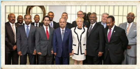
Humpty Dumpty Welcomes Delegation of Presidents from Historically Black Colleges and Universities (HBCUs) to the United Nations

HDI's Higher Education Alliance (HEA) helps create the next generation of global leaders by connecting universities around the world to the United Nations. HEA provides students of international affairs with a comprehensive range of services, resources and opportunities for them to gain hands-on experience working with the United Nations. Currently, we have 58 member schools and can reach nearly 300,000 students. HEA member schools host senior ranking UN officials, Ambassadors, policymakers and leading experts in world affairs as guest lecturers, and visit UN Headquarters in New York for intensive orientation sessions, seminars and conferences to engage, experience and explore the UN, and the wide range of global issues on its agenda firsthand.