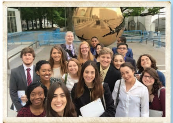
Students from around the world join HDI's Boot Camp

The Humpty Dumpty Institute's annual United Nations Boot Camp takes place in early June. In 2015, seventeen participants from seven countries (Australia, China, Ethiopia, Liberia, Sudan, Turkey and the United States) representing fourteen universities took part in HDI's signature higher education program. This program helps create the next generation of global leaders by connecting students with the United Nations and by building bridges between the international body and universities around the world.