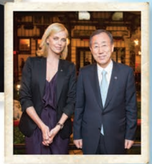
Charlize Theron and United Nations Secretary General, Ban Ki-Moon

Working in the UN community for nearly 20 years, HDI has learned that there are many sovereign nations, public policy organizations, academic institutions, and even businesses which seek to forge closer ties and closer cooperation with the United Nations in order to support the UN agenda and advance specific issues and topics that benefit all concerned. The Humpty Dumpty Institute has strong expertise in providing sound strategy and assistance to third parties outside of the United Nations who wish to support UN projects, for example, like the set of 17 Sustainable Development Goals published by the international body. The UN will need help from many different institutions to meet this very ambitious set of development goals.