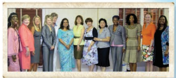
UN Women Ambassadors visit Charleston, South Carolina

One of HDI's most popular programs is called "UN Across America." This program is designed to take foreign diplomats assigned to the United Nations to parts of America which they might not have normally had the opportunity to visit during their tenure. Through this program we ensure that these diplomats understand that New York is not America. Humpty Dumpty organized its first "U.N. Across America" trip in April 2005 with a visit to New Orleans by eight women UN ambassadors.