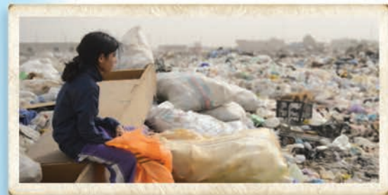
"Kingdom of Garbage," A Film By Yasir Kareem

The Humpty Dumpty Institute has also organized a new project with fifteen Pakistani filmmakers. This is one of HDI's most interesting programs and has drawn the attention of thousands of filmmakers around the world who are looking for similar opportunities.